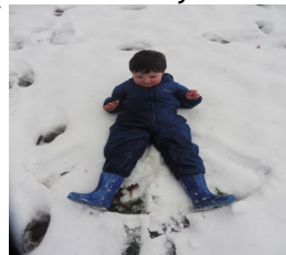
We're Going on a Bear Hunt Michael Rosen Helen Oxenbury

It was wonderful hearing about their sledging experiences and their fantastic snowmen which had been made at home, with carrots, buttons and bananas for the face! Following on from this we have been making snowy pictures at Nursery with a range of media such as cotton wool, silver foil and glitter to get that snowy effect. The children have also been exploring and playing with the snow during Forest Fun this week, making snow angels and having an amazing time in the snow!