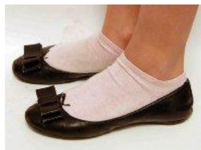
Inappropriate Footwear & Socks