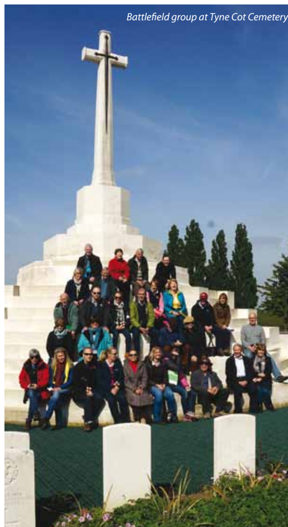
Battlefield group at Tyne Cot Cemetery

The weekend was thought provoking, informative, enjoyable and will live in everyone's memory for a long time. Many have expressed their wish to do a follow-up tour next year ... watch this space!