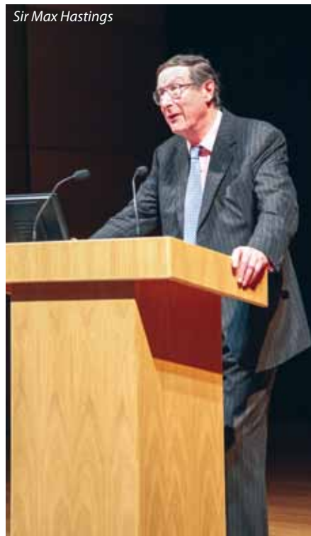
Sir Max Hastings

We were joined in March by Sir Max Hastings, journalist and historian, whose lecture on 1914 in the School Auditorium was a sell-out. He held his audience captive with his compelling narrative, judgement and evaluation. Even those unfamiliar with the events of 1914 would have left with a greater understanding and a desire to learn more. Sir Max was also kind enough to host a supper with historians and stay at the end of the lecture to talk to guests and sign many copies of his book, 1914: Catastrophe .